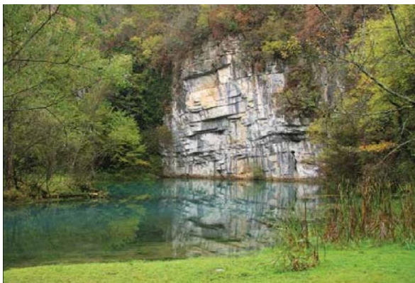
Plut D. et al., 2014. Regionalni viri Slovenije: Vodni viri Bele krajine (Water resources of Bela krajina), 15.